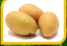
B4560 | Chef Potato 50#