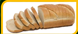
40229 | Rye Reuben Sliced Rotella 6ct