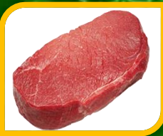
47633 | Corned Beef Rounds Raw RMC 4/6#