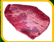
40229 | Corned Beef Brisket RMC 16#

Operator Cost: $4.00 | Menu: $14.00 | Gross Profit: $10.00 (71%)