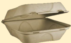
66943 | Fiber Container Hinged 1 Comp 9x9x3 WC 250ct.

These eco-friendly containers are made from unbleached plant fiber and are great for grocery stores, delis and restaurants. They are compostable, freezer safe, soak proof, and have no wax or plastic lining.