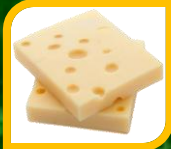
11150 | Swiss Slices 11014 | Swiss Loaf