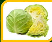
B3250 | Cabbage Fresh 50#