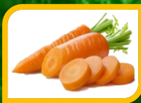
B3340 | Carrots Jumbo Whole 50#