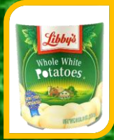
95238 | Potatoes 6/#10