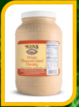
40228 | 1000 Island 4/1 Gal