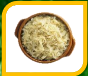
95080 | Sauerkraut 6/#10