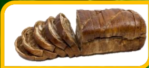
40228 | Rye Marble Reuben Sliced Rotella 6ct