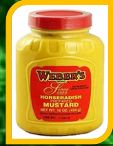
53235 | Mustard Webers 12/16oz