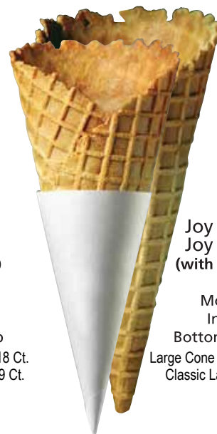
Joy #7180 Waffle Joy #7192 Waffle (with or without jacket) Height: 7" Mouth Width: 3" Inside Dia.: 2 3 / 4 " Bottom Outside Dia.: Tip Large Cone Code 01708 • Pack 12/16 Ct. Classic Large Code 08063 - 180 Ct.