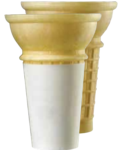
Joy #60 (with or without jacket) Height: 3 13 / 16 " Mouth Width: 2 3 / 16 " Inside Dia.: 1 1 / 4 " Bottom Outside Dia.: 1 1 / 16 " Sleeve Code 08053 - 22/22 Ct. Jacket Sleeve Code 08054 - 22/22 Ct.