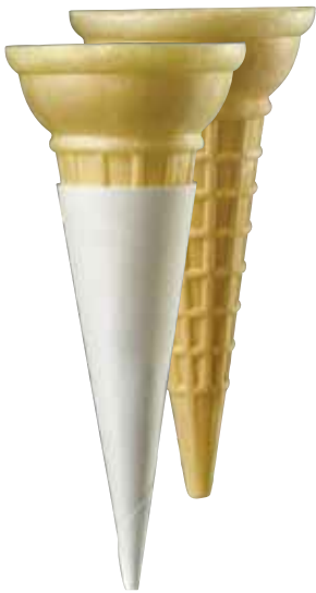
Joy #1 (with or without jacket) Height: 4 1 / 16 " Mouth Width: 2 5 / 16 " Inside Dia.: 1 1 / 16 " Bottom Outside Dia.: Tip Code 01734 - 8/132 Ct. Bulk Code 08001 - 1/338 Ct.