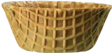
Joy #87060 Waffle Bowl Height: 1 3 / 16 " Mouth Width: 4 1 / 2 " Inside Dia.: 4 1 / 4 " Bottom Outside Dia.: 2 5 / 16 " Code 82243 • Pack 6/10 Ct.