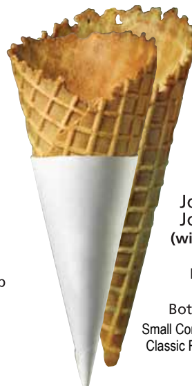
Joy #6216 Waffle Joy #6228 Waffle (with or without jacket) Height: 6" Mouth Width: 2 5 / 8 " Inside Dia.: 2 5 / 8 " Bottom Outside Dia.: Tip Small Cone Code 01711 • Pack 12/18 Ct. Classic Regular Code 08059 - 12/19 Ct.