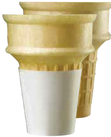
Joy #40 (with or without jacket) Height: 3 3 / 16 " Mouth Width: 2 3 / 16 " Inside Dia.: 1 1 / 4 " Bottom Outside Dia.: 1 3 / 8 " Bulk Code 08051 - 1/300 Ct. Jacket Sleeve Code 08052 - 30/200 Ct.