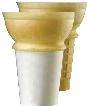
Joy #30 (with or without jacket) Height: 3 1 / 16 " Mouth Width: 2 1 / 2 " Inside Dia.: 1 1 / 16 " Bottom Outside Dia.: 1 1 / 4 " Bulk Code 08048 - 1/275 Ct. Sleeve Code 08049 - 30/25 Ct. Jacket Sleeve Code 08050 - 30/25 Ct. Dispenser Code 08057 - 6/100 Ct. Dispenser Code 82242 - 6/100 Ct.