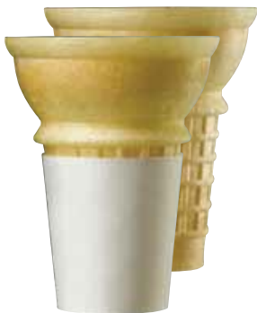
Joy #22 (with or without jacket) Height: 2 3 / 16 " Mouth Width: 2 3 / 16 " Inside Dia.: 1 1 / 16 " Bottom Outside Dia.: 1 3 / 16 " Code 08047 - 8/108 Ct.