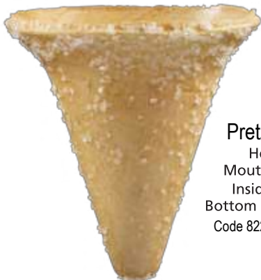
Pretzel Cones Height: 3 5 / 16 " Mouth Width: 3" Inside Dia.: 2 3 / 4 " Bottom Outside Dia.: Tip Code 82243 • Pack 6/10 Ct.