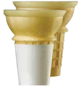
Joy #10 (with or without jacket) Height: 2 3 / 16 " Mouth Width: 2 5 / 16 " Inside Dia.: 1 1 / 2 " Bottom Outside Dia.: 1 1 / 2 " Bulk Code 01712 - 1/338 Ct. Jacket Code 08043 - 8/112 Ct. Sleeve Code 08044 - 36/20 Ct. Jacket Sleeve Code 08046 - 36/20 Ct. Dispenser Code 08055 - 8/112 Ct.