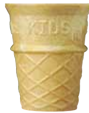
Joy Kids Cone® Height: 1 3 / 4 " Mouth Width: 1 1 / 2 " Inside Dia.: 1 1 / 4 " Bottom Outside Dia.: 1 / 16 " Code 08078 - 28/45 Ct..