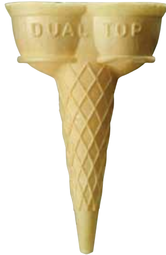
Joy Twin Scoops Height: 4 13 / 16 " Mouth Width: 3 3 / 16 " x 1 1 / 16 " Inside Dia.: 2 1 / 16 " x 1 1 / 16 " Bottom Outside Dia.: Tip Code 08056 - 6/60 Ct. Bulk Code 82246 - 1/180 Ct.