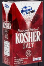
01157 | Diamond Crystal Kosher Salt 12/3lb.