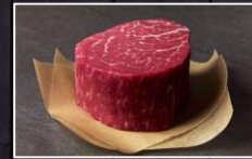
A4200 | 1855 Tenderloin Extremely Tender Cut Charge a Premium for Tenders!