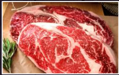
A2001 | 1855 Boneless Ribeye Classic Cut, Very Tender Menu Staple!

1855® Black Angus Beef has built its legacy on producing consistently premium beef. Using strict program specifications and partnering with family ranchers who have a passion for raising high-quality Angus cattle. 1855 delivers beef with reliable quality and unwavering consistency. Offered in USDA Prime and Upper 2/3 Choice, 1855 Black Angus Beef provides the flavor, tenderness, and juiciness that discerning chefs and guests know they can trust.