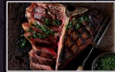
A5600 | 1855 Porterhouse Larger Cut – Strip & Filet Use 24oz for Gr8 Plate Coverage!

Exclusive Supplier of 1855 C.A. Supply Premium Beef Products