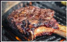
A2101 | 1855 Cowboy Ribeye Highly Marbled w/ Rich Flavor The Meat Eaters Steak | Thick & Juicy!