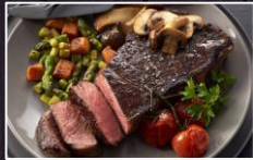
A1300 | 1855 NY Strip Firm Lean Cut Versatile Cut for entrees & salads.