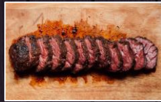
85603 | 1855 Hanger Butcher's Favorite Cut Great Plate Profit!